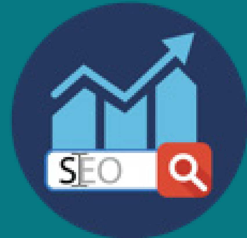
S.E.O & ADWORDS CAMPAIGN